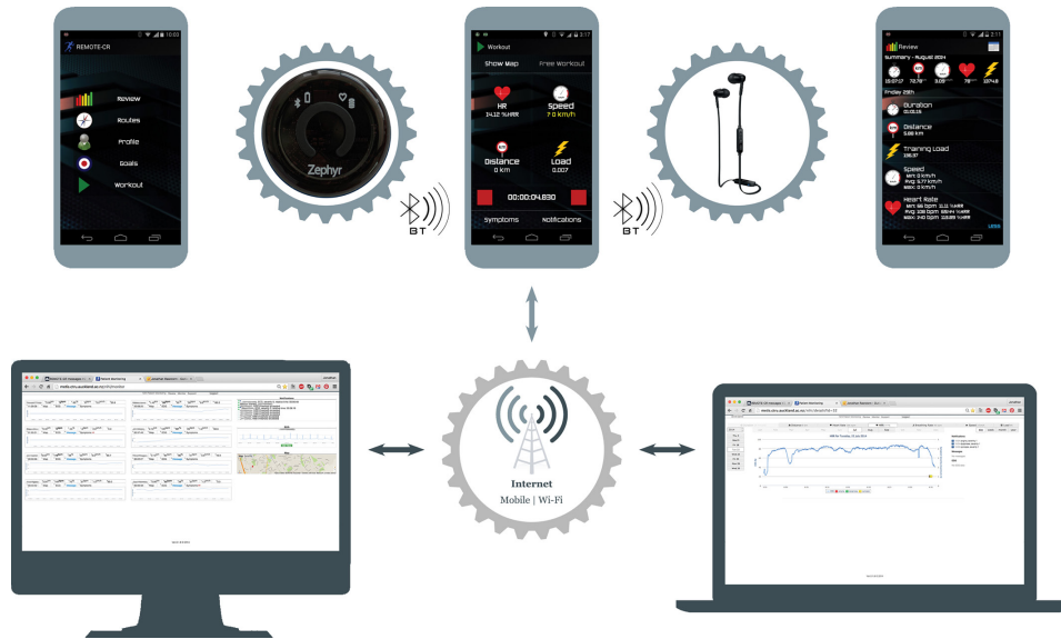
Figure 1 Remotely monitored exercise-based cardiac telerehabilitation platform schematic.