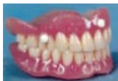
See p 209