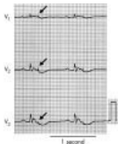
See p 444