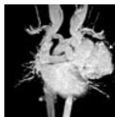
See p 41