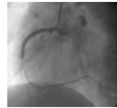
See p 198