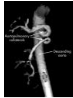
See p 549